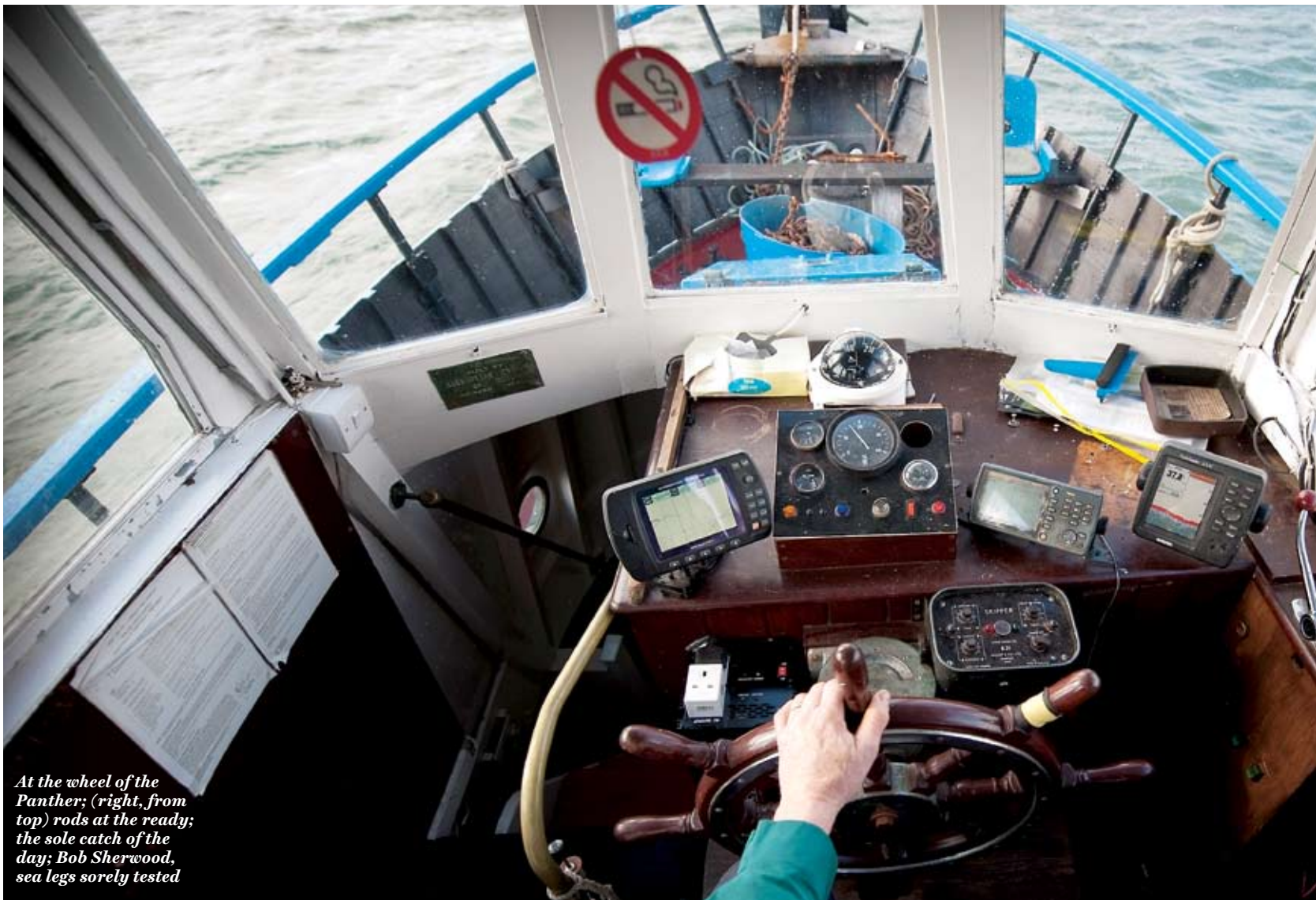
At the wheel of the Panther; (right, from top) rods at the ready; the sole catch of the day; Bob Sherwood, sea legs sorely tested